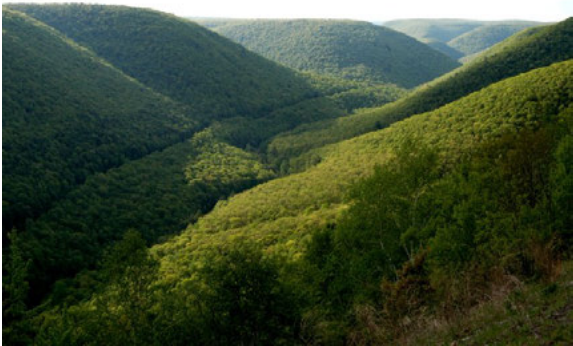
Back on US 6 – headed to Coudersport